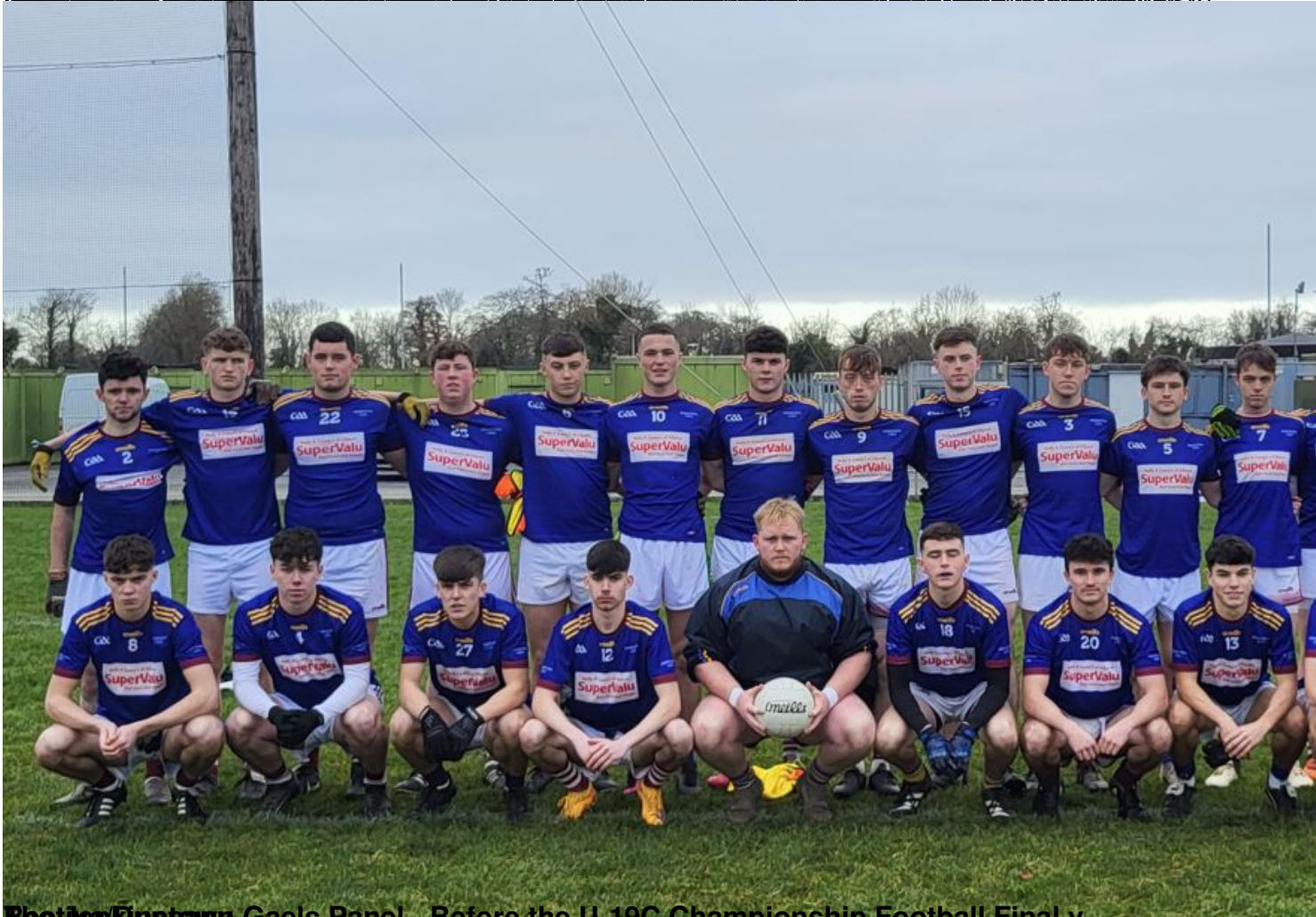
Bective/Dunsany Gaels Panel - Before the U-19C Championship Football Final v