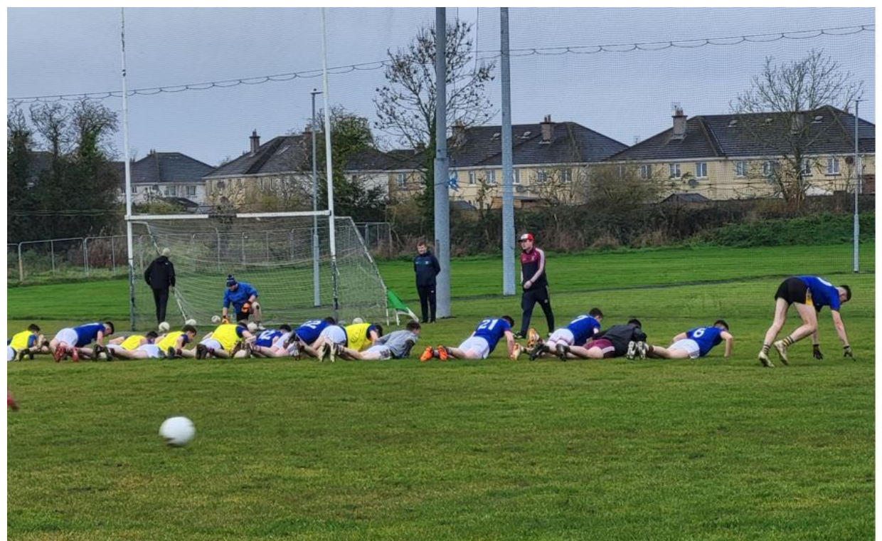
Jenkinstown Gaels easily overcame Na Fianna in the semi-final of the Coolrite U-19C Football Championship played at Enfield on Saturday afternoon to book their place in next week's final.