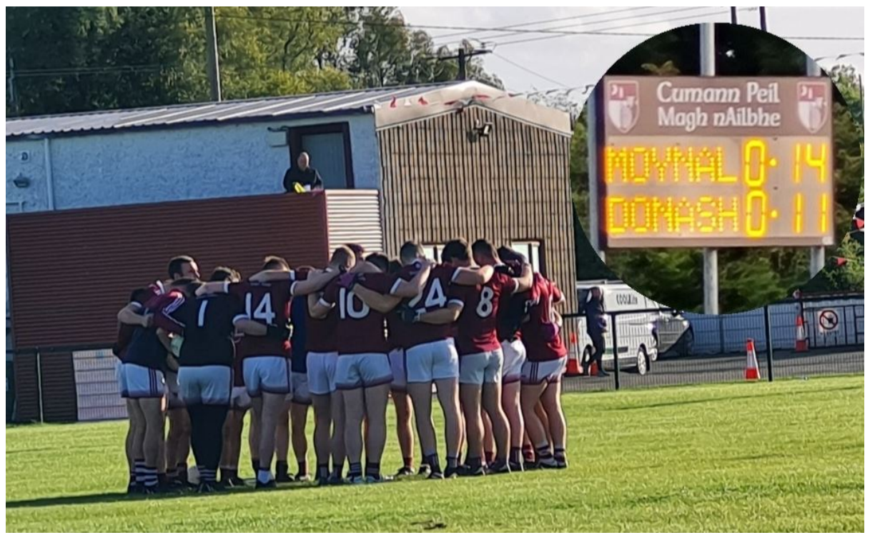
Moynalvey secured their place in the final of the Div. 3 Reserve cup with a three point win over Donaghmore/Ashbourne in the semi-final played at Kilmore Park Moynalvey on Saturday evening 1<sup>st</sup> October.